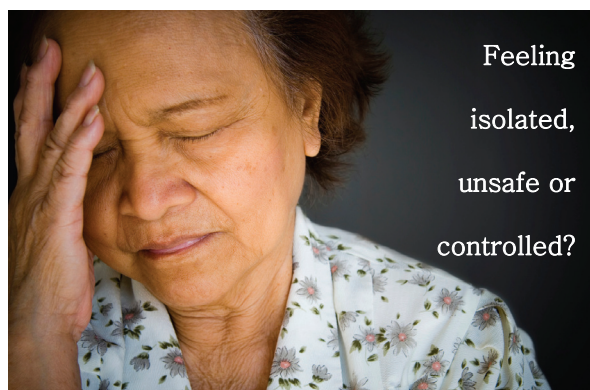
New material from OSV raises awareness about elder abuse. www.seniorsrights.org.au