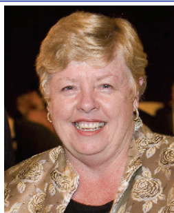
Special guest Christine Nixon

The evening raised over $2800 to support Cameron House, a Yarra Glen project to re-establish a local medical clinic. As there are currently no local medical facilities, many bushfire affected people with ongoing health problems are forced to travel to Healesville or Lilydale for medical assistance.